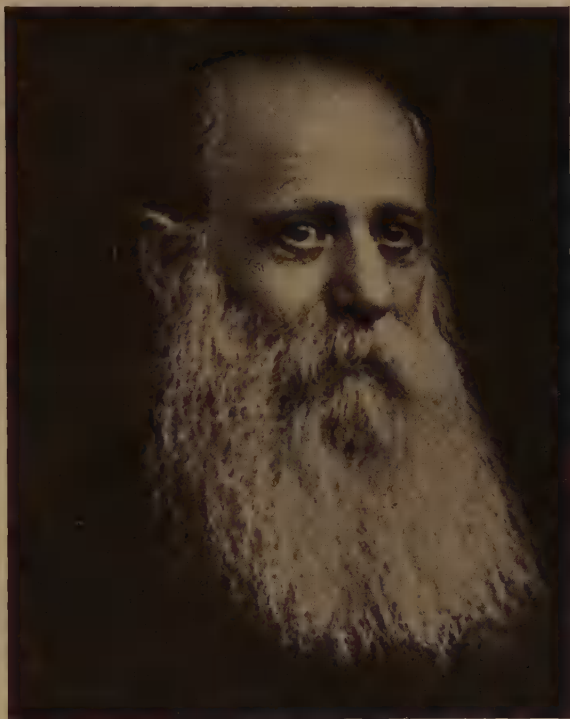
MOSES LÖB LILIENBLUM