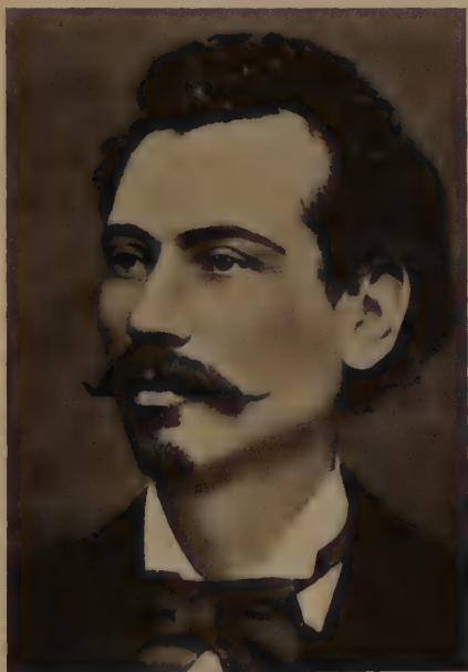
PEREZ BEN MOSHEH SMOLENSKIN 1842-1885